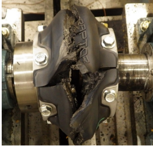
Figure 3: Excessive torque and misalignment

In the case of elastomeric couplings, creep means progressive wind up, or torsional strain, when the element is exposed to constant torque or shock loading for extended periods of time. If the coupling is designed and sized appropriately, the stress level in the material will be low and the amount of creep will be minimal. Figure 2b , above, represents the creep associated with a properly sized coupling. This coupling would likely never fail due to creep. Under higher stress levels, the element would continue to creep until creep rupture. The image below shows a Raptor coupling subject to excessive torque and misalignment for an extended period of time. The amount of creep before rupture can be seen in the misalignment of the split in the element.