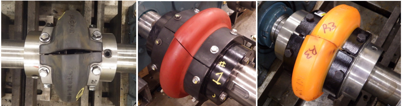
Figure 1: Creep examples

In engineering, one of the more common questions we get on the Raptor coupling deals with twisting of the element. Many customers incorrectly assume this is a sign of failure. This phenomenon is common to any type of elastomeric coupling and is the result of a process called creep. The images below show several examples of creep.