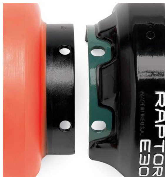
Figure 2: Circular through holes (left) versus slotted through holes (right)