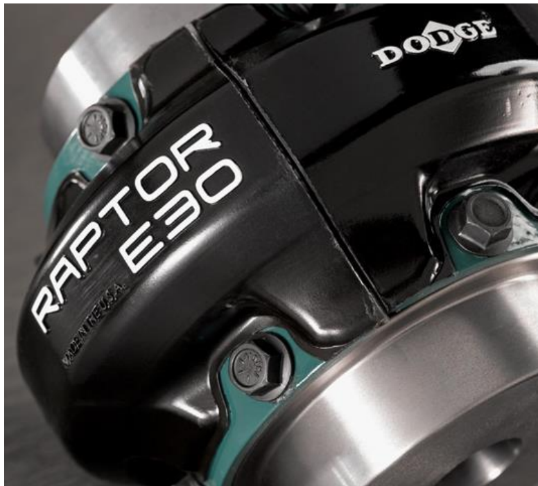
Figure 3: Split Natural Rubber Element Design

With the Raptor's horizontally split element, fasteners are designed to install radially instead of axially, meaning that this design does not require the locking of shafts during installation. The two part element assembly separates horizontally along the shaft axis. This means the Raptor does not require movement or re-aligning of connected equipment when the element needs to be replaced. Figure 3 below provides a visual of the horizontally split element assembly and the radially mounted fasteners.