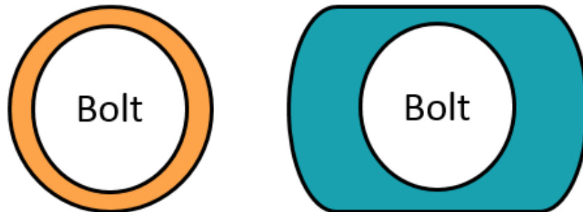
Figure 1: Competitor through hole (left) vs. Raptor slotted through hole (right)

The slotted clamp ring holes in the Baldor•Dodge Raptor offer 187% extra mounting hardware clearance versus competitor's circular through-holes. Figure 1 shows the interpretation of the extra clearance of the Raptor's slotted through-hole compared to the competitor's circular through-hole design. This provides users with additional clearance for significantly easier installation. Slotted clamp ring holes also minimize the potential for cross-threading and reduce the need for re-alignment during installation. Figure 2 provides a side by side comparison of the two types of through holes.