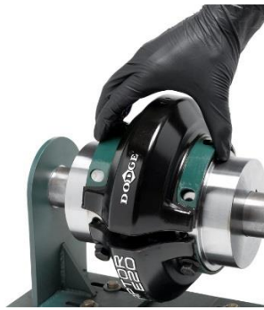
Step 2: Set Spacing