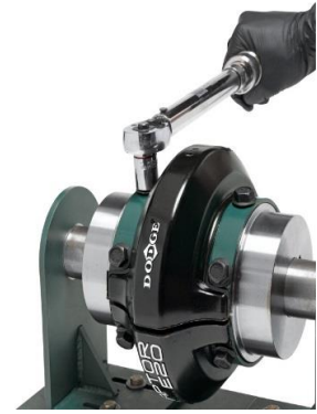
Step 3: Install Element