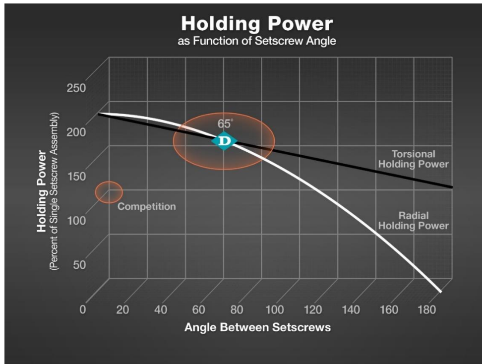
Figure 2. Holding power as a function of setscrew angle

The addition of a second setscrew only benefits the holding power of the assembly if the second setscrew is positioned in such a way that it maximizes the contact between the shaft and hub. The Dodge Raptor utilizes a second setscrew located 65° away from the first setscrew. Research has shown that positioning the second setscrew 65° away from the first provides the optimal combination of both Radial holding power ensures contact is maintained between the shaft and the inner diameter of the coupling hub bore. Torsional holding power minimizes the twisting motion between the shaft and coupling hub caused by torque fluctuations and spikes. Figure 2 shows the torsional holding power and the radial holding power of two setscrews in the same plane at varying angles of separation.