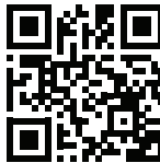
ABB Motors and Mechanical Inc.

Detailed information on programming and setup of the drive can be found in the instruction manual and the quick start guide by following the QR code below: