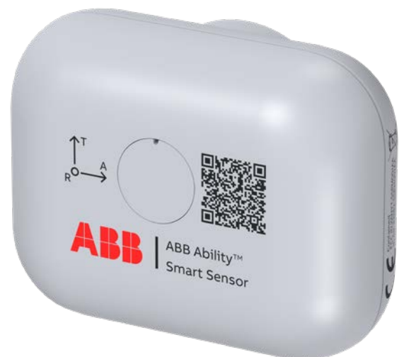
Gen 2 Smart Sensor suitable for hazardous locations