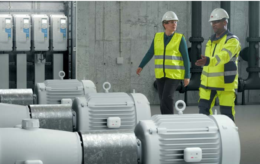
ABB Ability™ Smart Sensors Baldor-Reliance® motors condition monitoring