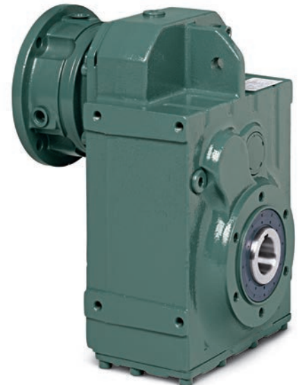
QUANTIS MSM (Motorized Shaft Mount)