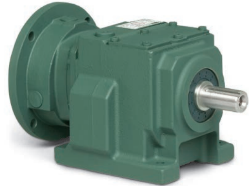
QUANTIS ILH (In-Line Helical)

Reducer gears and bearings are splash lubricated using an ISO 220 lubricant which provides protection against rust. The standard mineral oil lubricant allows an operating temperature range of 10°F to 104°F (-12°C to 40°C) ambient. Higher or lower ambient temperature conditions are addressed with optional synthetic oil.