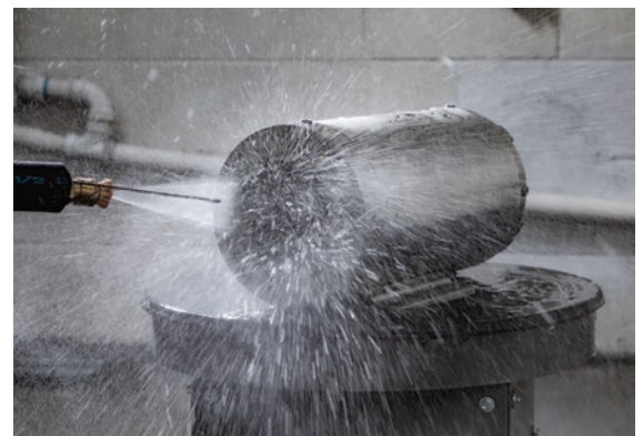
TENV SSE motor being tested for IP69K