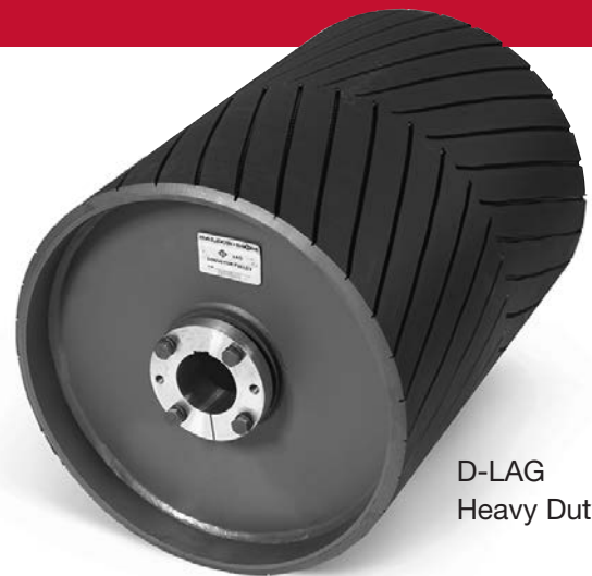
D-LAG Heavy Duty Drum

Independent testing in 2012 showed D-LAG significantly outperforms other rubber formulas when subjected to abrasive conditions. D-LAG has been delivering higher quality, longer life and lower total cost of ownership on conveyors worldwide for over 15 years.