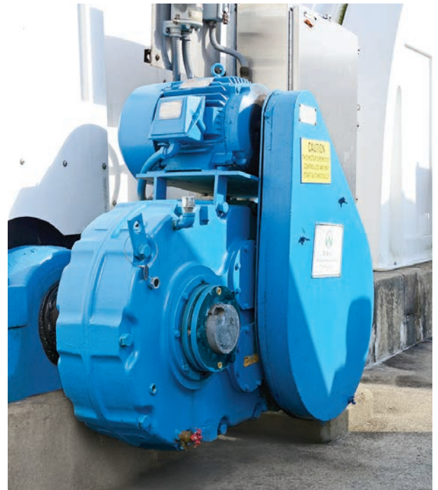
BioDisc on rotating biological contactor.

Overcoming the challenges of an aging infrastructure and managing operating and capital costs is among the top concerns today in the Wastewater Industry. With over a century of experience, Baldor designs and manufactures innovative, robust, efficient mechanical power transmission products that are built to last in the harshest of environments. Our corrosion resistant materials and coatings, along with advanced sealing technologies were developed with demanding wastewater applications in mind. These features result in improved output, reduced downtime, less costly operation and maintenance, and more reliable performance. Baldor is committed to offering products and services to address the wastewater issues now and into the future.