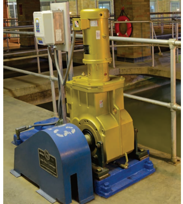
Quantis reducer in flocculation.

Delivering an adequate and continuous supply of water for residential, public, commercial, fire, and industrial utilization is a fundamental objective of every water treatment plant. At Baldor, we understand the criticality of providing uninterrupted water supply and have designed mechanical power transmission products and solutions for high performance and superior reliability. Our products are built to perform dependably under conditions such as constant moisture, extreme temperatures, and chemical exposure. Baldor is dedicated to providing products that reduce your plant's operating costs and meet the increasing demand for water.