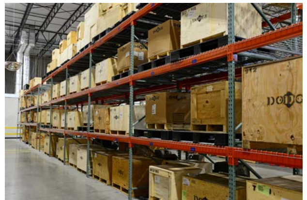
ABB Motors and Mechanical Inc. 6040 Ponders Court Greenville, SC 29615 Ph: 864.297.4800

Mechanical Power Transmission Support Ph: 864.297.4800