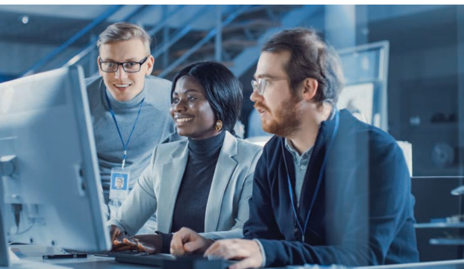
ABB Reliability Service for motors Peace of mind for plant productivity

Plant productivity depends on equipment operating reliably. ABB Reliability Service provides the digital advantage you need to improve efficiency, reliability and safety for end users by utilizing our expertise and ABB Ability™ solutions to remotely monitor your motors and other assets.