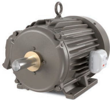
ABB offers a unique digital advantage by combining connectivity and data analytics with our expertise to make your operations efficient, predictable and safe. The chart below shows the advantage to using ABB Ability Smart Sensor for motors and ABB Reliability Services.