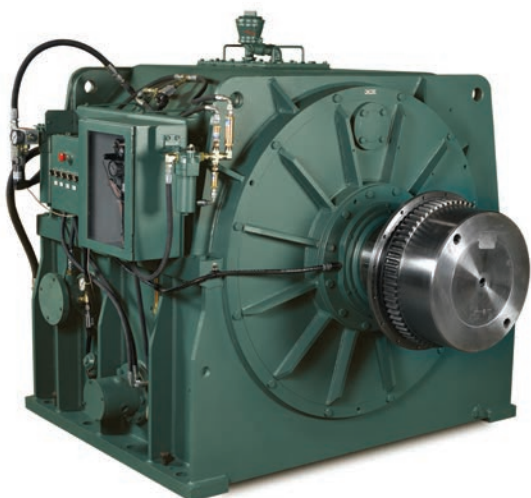
ABB services and upgrades Dodge CST gear reducers. All work is performed using genuine factory parts built to factory specifications by ABB factory employees.