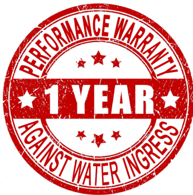
ABB Motors and Mechanical Inc. 5711 RS Boreham Jr. Street Fort Smith, AR 72901

Dodge Food Safe gear reducers feature a one-year warranty against failure due to water ingress. This first in the industry warranty allows users to clean and sanitize their equipment with peace of mind knowing that it will continue to perform.