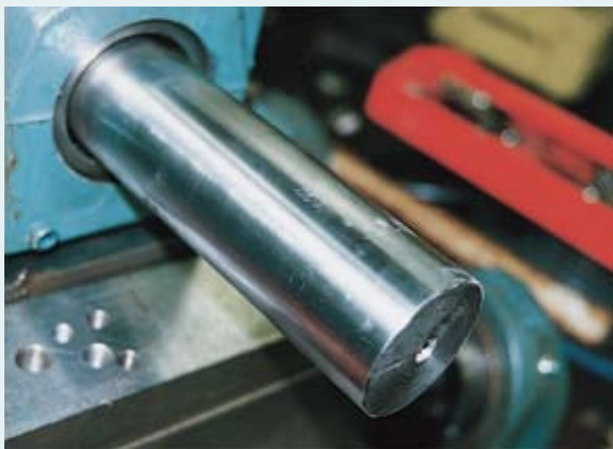
No Fretting corrosion or shaft damage with GRIP TIGHT Adapter Bearing Assembly