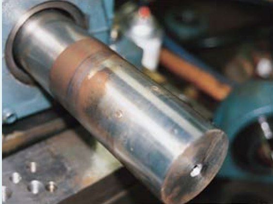
Typical Fretting corrosion and shaft damage with Setscrew Bearing