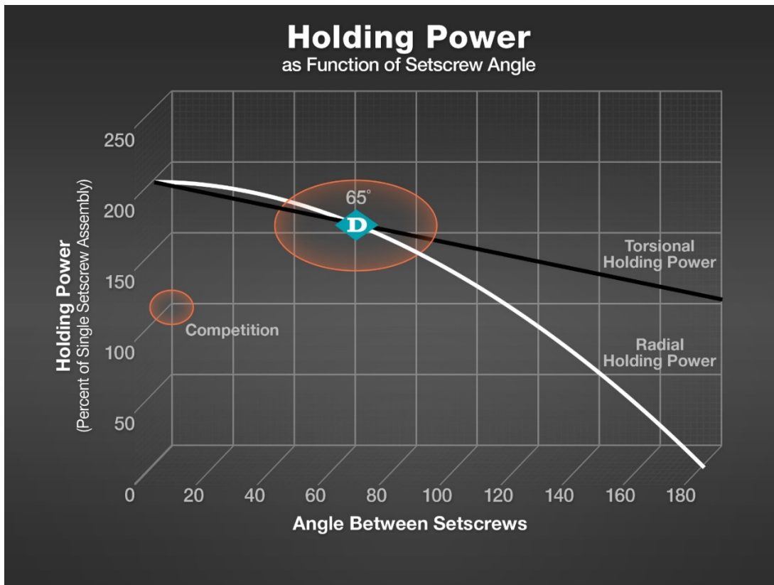
FIGURE 2: HOLDING POWER AS A FUNCTION OF SETSCREW ANGLE.

As shown in Figure 2, the radial holding power and the torsional holding power of two setscrews decreases as the angle increases from 0° to 180°. Positioning the second setscrew at 90° apart causes uneven torsional and radial holding power. Increasing the angle to 180° can actually reduce the total effectiveness of the two setscrews and reduce the total holding power, while maximizing stresses in the hub. It can also be seen that the lines representing radial holding power and torsional holding power only intersect at two locations; 0° and 65°. Positioning two set screws at 0° from each other is physically impossible as the setscrews would have to be within the same cross-sectional plane. For this reason, the next best choice is 65°. This allows the setscrews to provide equal amounts of radial and torsional holding power, maximizing the Raptor hub's stability on the shaft while also minimizing the tangential and bending stresses induced in the hub.