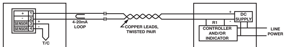
Figure 2 - Thermocouple Transmitter Wiring

WARNING: Because of the possible danger to person(s) or property from accidents which may result from the improper use of products, it is important that correct procedures be followed: Products must be used in accordance with the engineering information specified in the catalog. Proper installation, maintenance and operation procedures must be observed. The instructions in the instruction manuals must be followed. Inspections should be made as necessary to assure safe operation under prevailing conditions. Proper guards and other suitable safety devices or procedures as may be desirable or as may be specified in safety codes should be provided, and are neither provided by Baldor Electric Company nor are the responsibility of Baldor Electric Company. This unit and its associated equipment must be installed, adjusted and maintained by qualified personnel who are familiar with the construction and operation of all equipment in the system and the potential hazards involved. When risk to persons or property may be involved, a fail safe device must be an integral part of the driven equipment beyond the speed reducer output shaft.