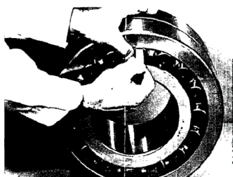
Figure 1 - Internal Clearance

2. Measure the internal clearance of the bearing before mounting. Place the bearing in a upright position as shown in Figure 1.